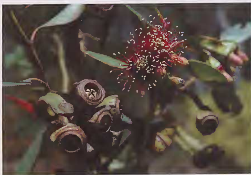
Figure 4. Buds, flowers and fruit of E. nutans in hand of Bremer Bay Identity Priscilla Broadbent.